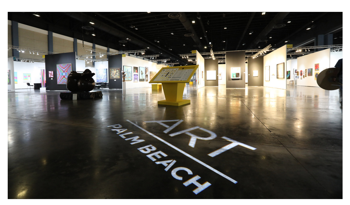
Art Palm Beach Returns, January 24-28, 2024!

To learn more about the Life is Why™ campaign and other participating companies, please visit <u>https://www.heart.org/en/get-involved/ways-to-give/life-is-why</u>. Connect with the American Heart Association on <u>heart.org</u>, <u>Facebook</u>, <u>Twitter</u> or by calling 1-800-AHA-USA1.