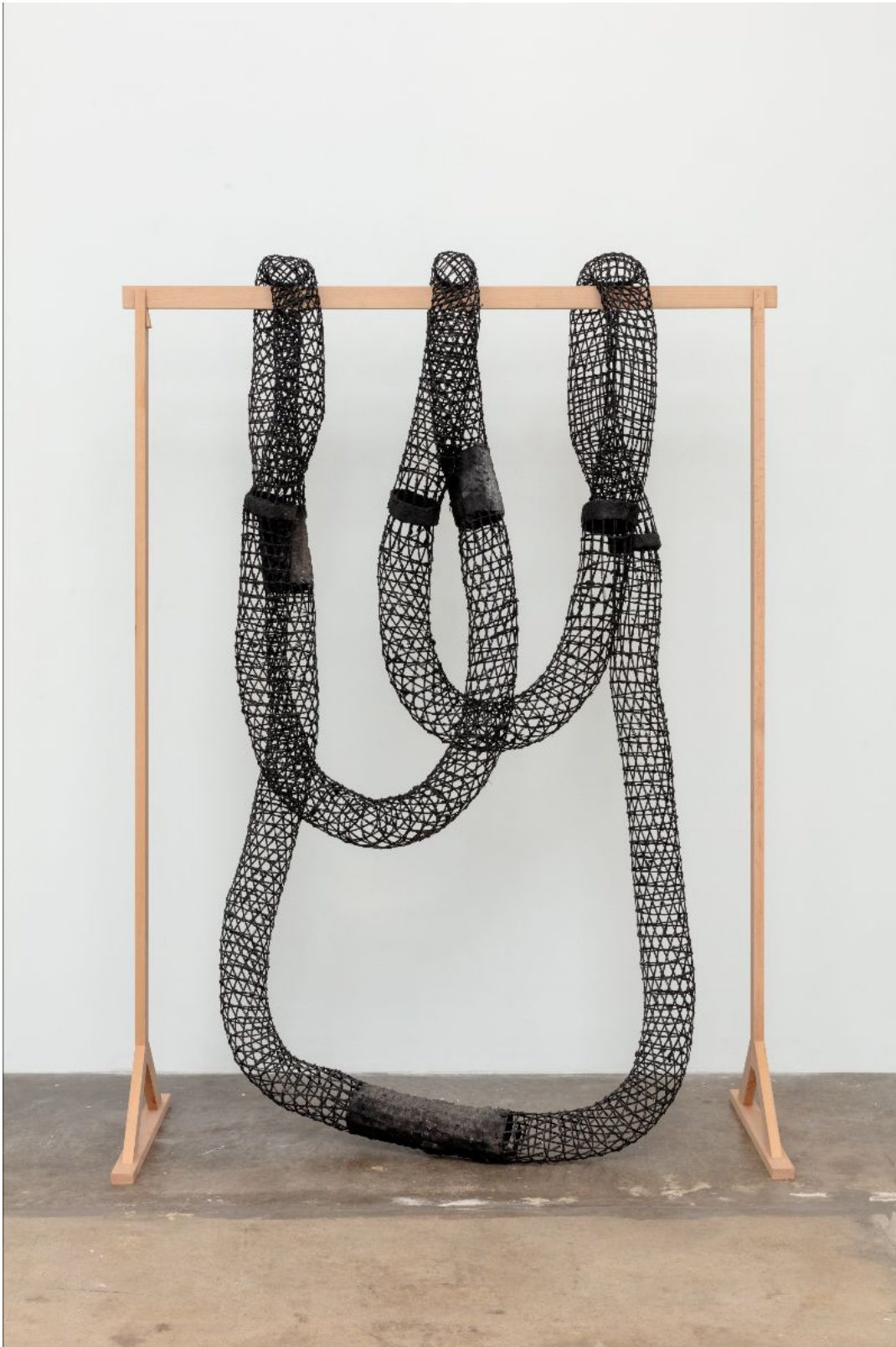
Sarita Westrup, 2023, the non-linear route, reed, mortar, metal, twine, wood, paint, graphite, 77 x 38 x 12 inches

incorporation of baskets, originally designed for transport and cradling, conveys tenderness and notions of home.