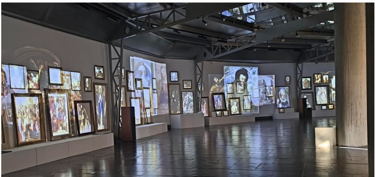
Installation views from the Museum AI exhibition

Museum AI is an Artistic Research entity that uses Artificial Intelligence (AI) to re-image and re-create lost pieces of art. The recreation of the collection of 57 lost paintings from Palencia Museum will be presented for this project. This collection disappeared and was largely forgotten and condemned to oblivion until now. Museum AI helps humanity appreciate and respect art and its value in recognizing our memory and cultural heritage.