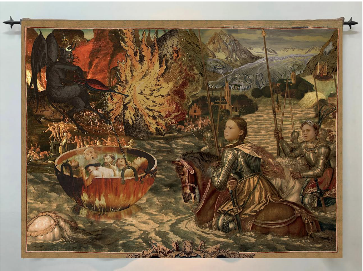
The Crusade of the Innocents (Global Warming) 2021. Woven tapestry. The series Mythstories explores contemporary myths using medieval and contemporary.