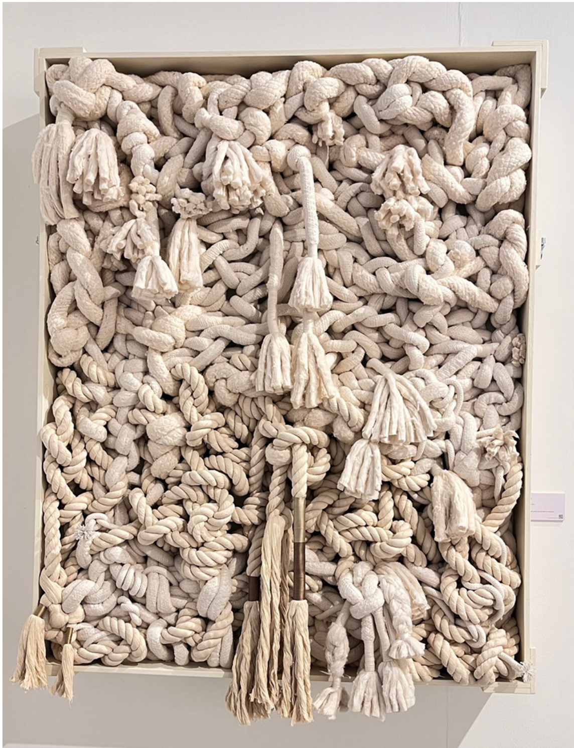
Jazmin by Cuchi Taborda

The gallery represents both established and emerging international contemporary artists engaged in painting, sculpture, installation, photography, video and new media, before a global audience. Blink Group prides itself on building meaningful bonds, expanding the reach of unique works of art to a broader audience, satisfying and enriching both collector and artist.