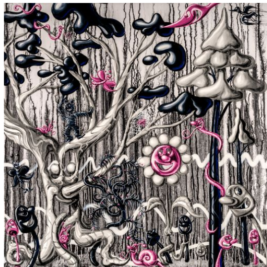
Kenny Scharf; Furungle Portfolio, 2021