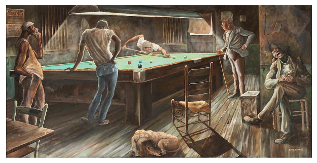
Ernie Barnes. Pool Hall, 1968. Oil on canvas. 24 × 48 inches

We're very pleased that New York-based Vallarino Fine Art will join us for the first time as an exhibiting gallery at Art Palm Beach 2024. The gallery's parallel program focuses on comparing the gestural and intuitive evolution from two generations of abstract artists: post-war American abstract painters along with an evolving group of young emerging artists considered representative of the new school of abstractionists.