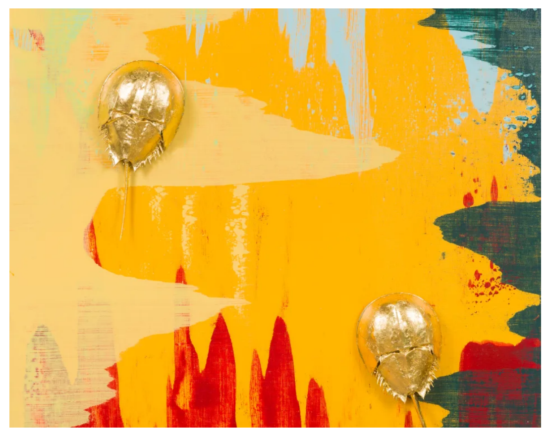
From the John Knuth Exhibit 'High Noon'

More can be viewed at: https://www.hollistaggart.com/