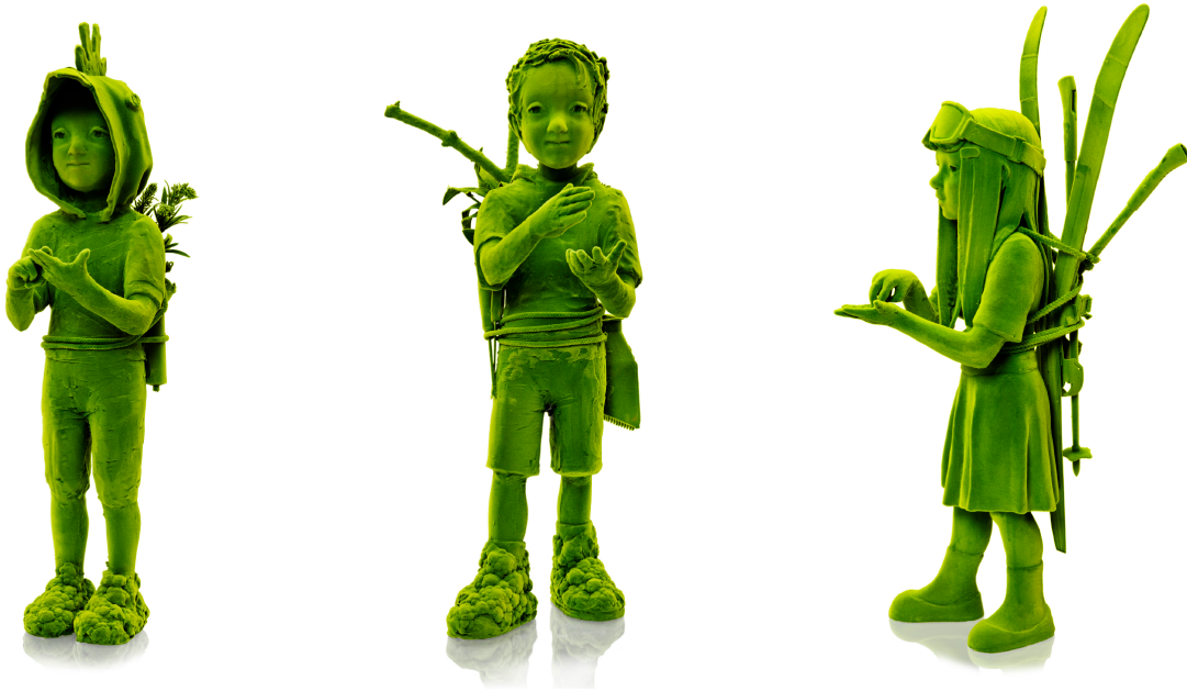
© Kim Simonsson. Images from the artist's series, Moss People.

We're delighted that Galerie Fledermaus joins us in 2023. The Chicago based galley specializes in modern and contemporary symbolist and expressionist works of art, bridging past and present. Fledermaus will present Kim Simonsson: Moss People at the 2023 fair. In his series of life-size figurative sculptures, Simonsson leads the viewer into an imaginative, fairytale-like world inspired by the forests of his native Finland, folklore, the idea of apocalypse, and the ambient hum of contemporary life.