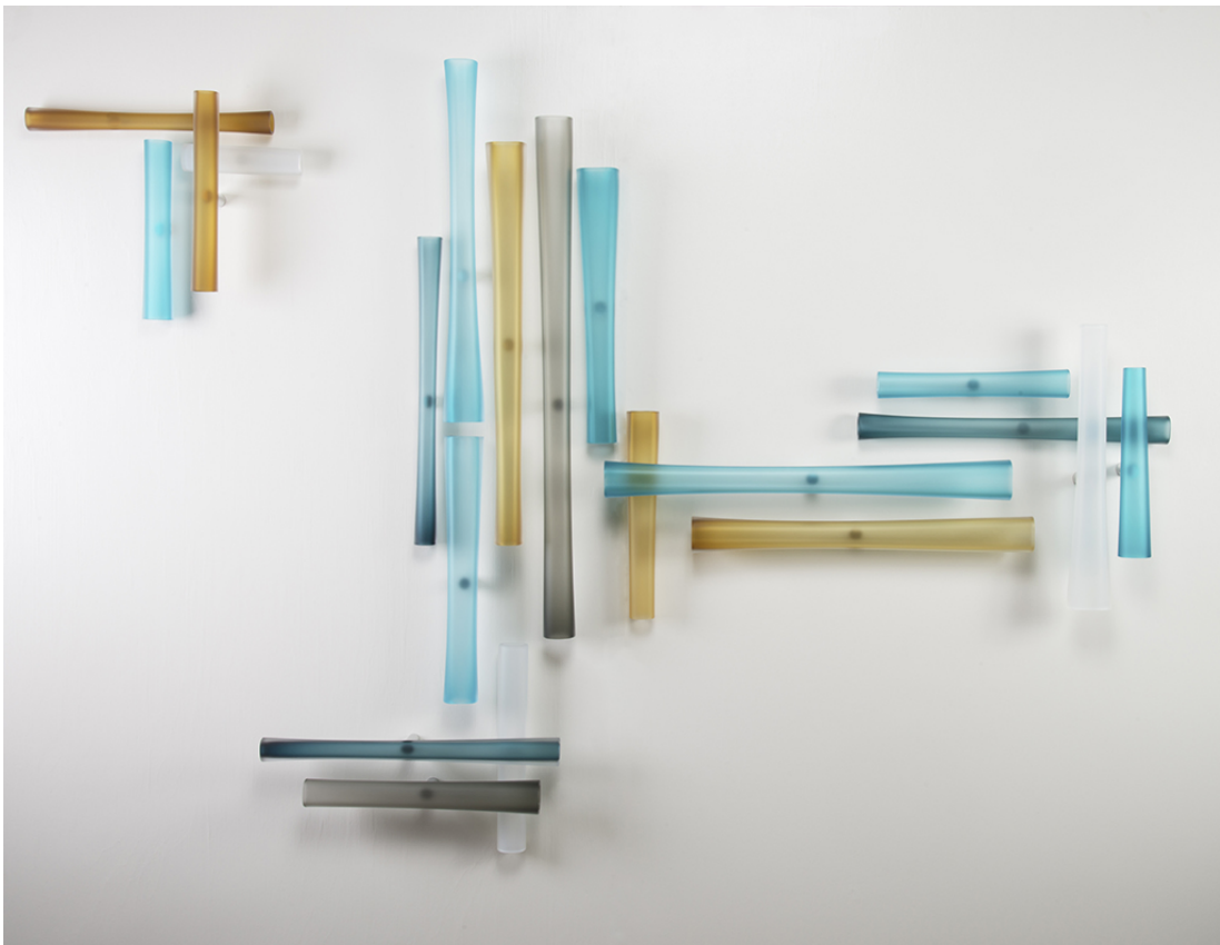
© Christopher Jeffries. Installation view of the artist's glass art.