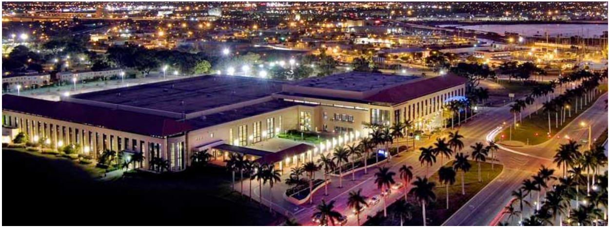
Palm Beach Convention Center