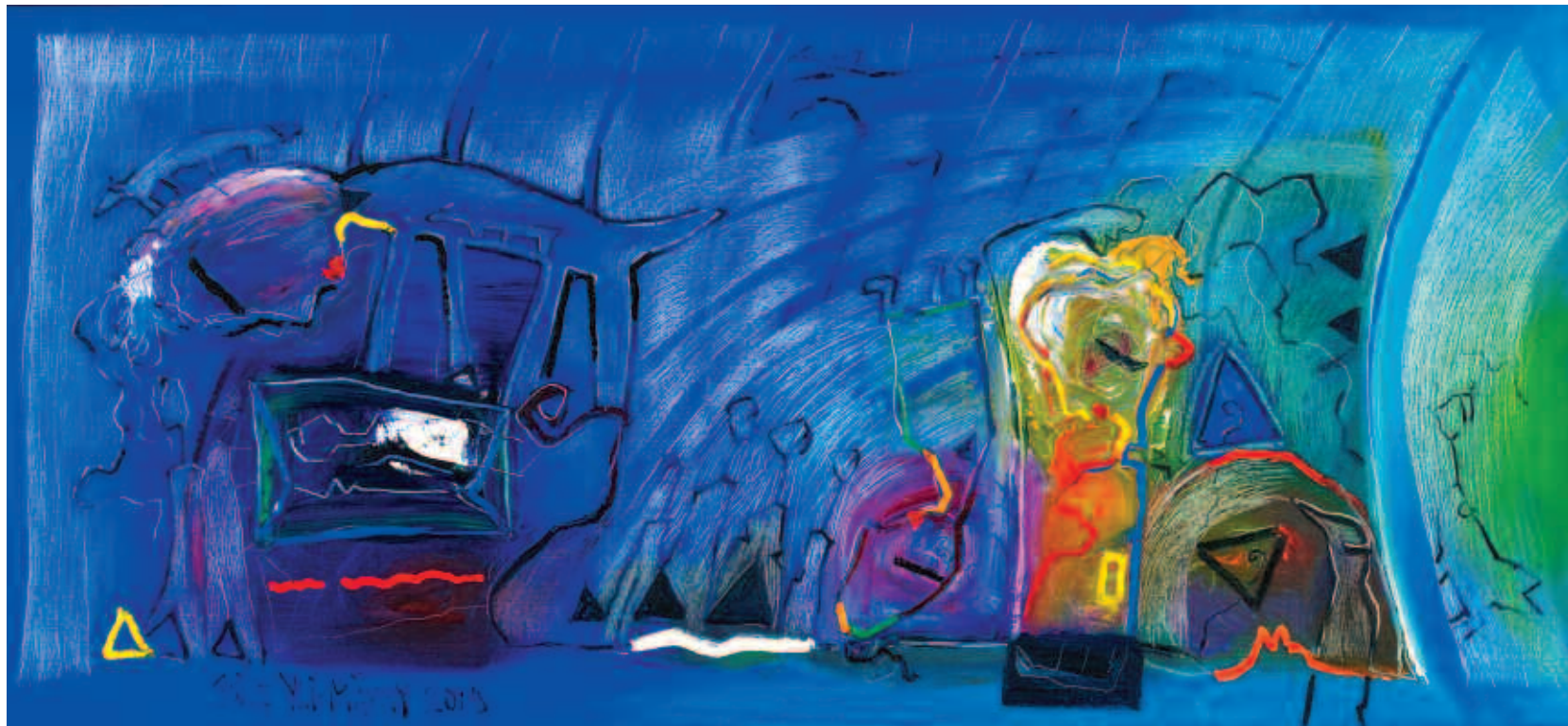
Finnish artist Soile Yli-Mäyry created the oil on canvas, Dream Pot , by using paint in three ways: a thin even coat, thick lines and by scraping lines into the painted area for a three-dimensional look.